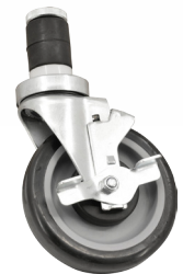
WORK TABLE CASTER