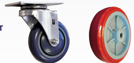
UTILITY CART CASTER