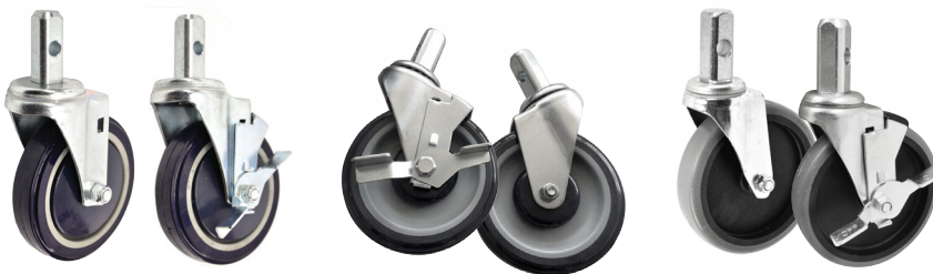
BUN PAN RACK CASTER