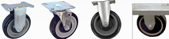
STOCKING CART CASTER