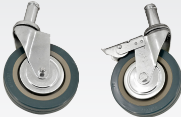
WIRE SHELF CASTER